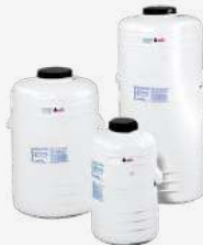
External tank Tank for purified water in one of three sizes (300 / 500 / 800 L)